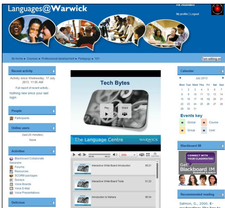
Figure 2. 101 course screenshot

The approach allows for situated learning whereby collaboration between novice and expert users of technology for learning co-operate in relevant, task based contexts, facilitating the transfer process. Shared participation in problem solving and negotiation of meaning allow for discussion of learning design. However, this is not a rapid development solution. Growth takes place in an organic way and the Community has to be "tended" to in order to ensure that timely interventions are available to support the expansion of the Community. The 101 course is built on the assumption that our tutors identify with a shared domain of practice, that of "language tutors who use technology". The extent to which this is true will vary and could be investigated more closely but our champions will play a key role in convincing others that belonging to this domain is to their advantage. It would appear that we should continue to investigate our progress and provide focused interventions in order to nurture an enterprise which is bringing positive impact to our teaching and learning.