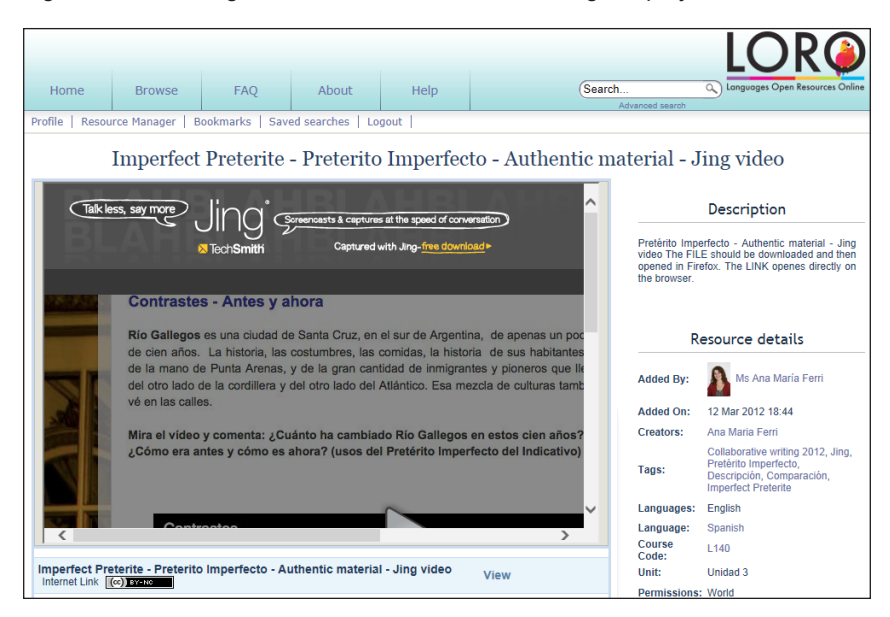
Figure 1. Teaching resource in LORO created during the project1

The project produced 19 useful teaching resources which can be found on the LORO website by searching for the 'collaborative writing' tag. Two are illustrated in Figure 1 and Figure 2.